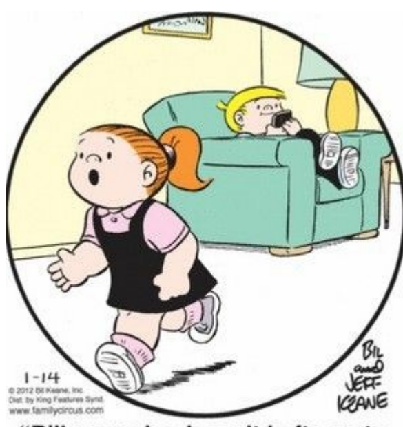
"Billy says he doesn't hafta go to church anymore 'cause his phone has an app for that!"